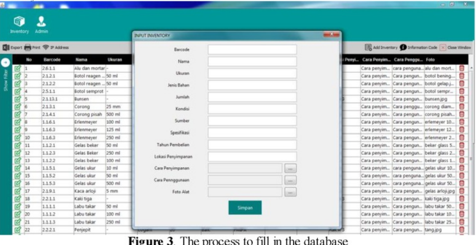
Figure 3 . The process to fill in the database

The students fill the Chemistry Laboratory Equipment Inventory database by clicking menu "Add Inventory"